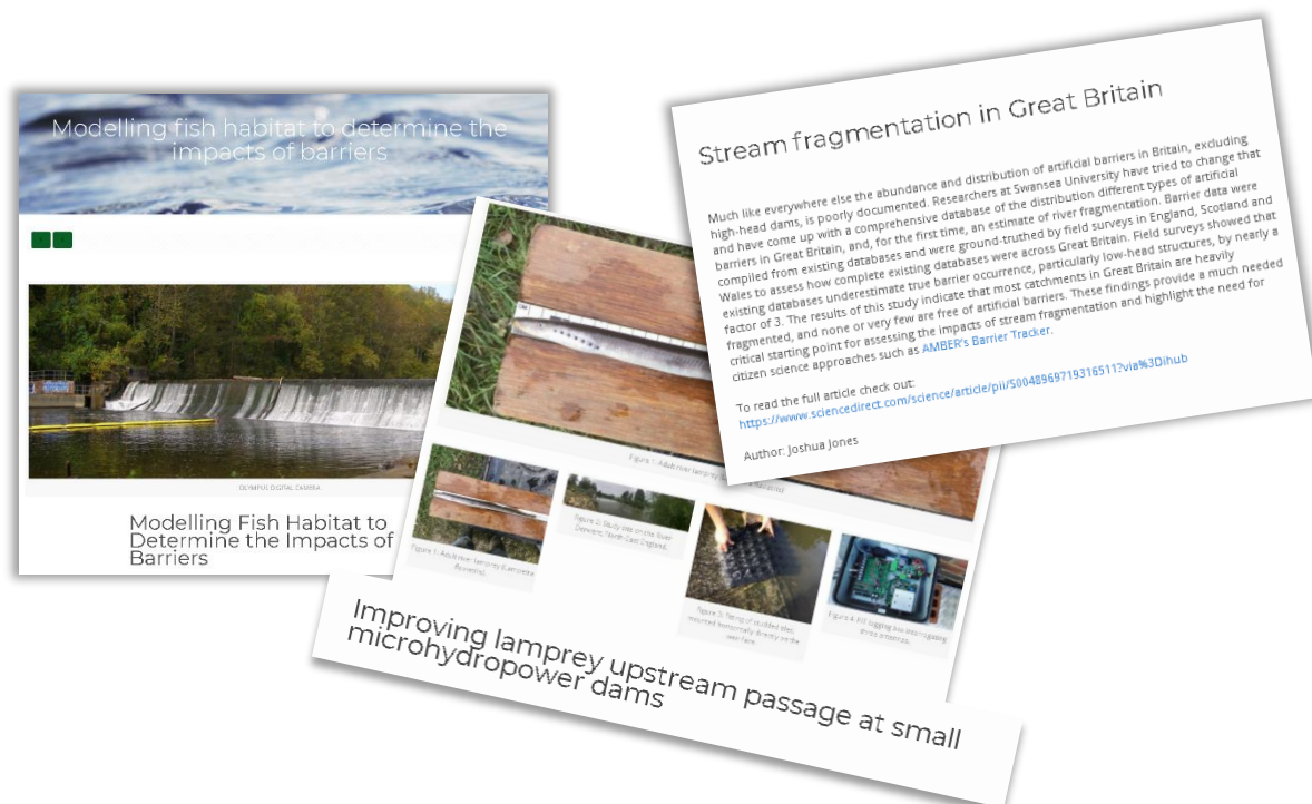
Figure 2. News items to disseminate peer reviewed publications.